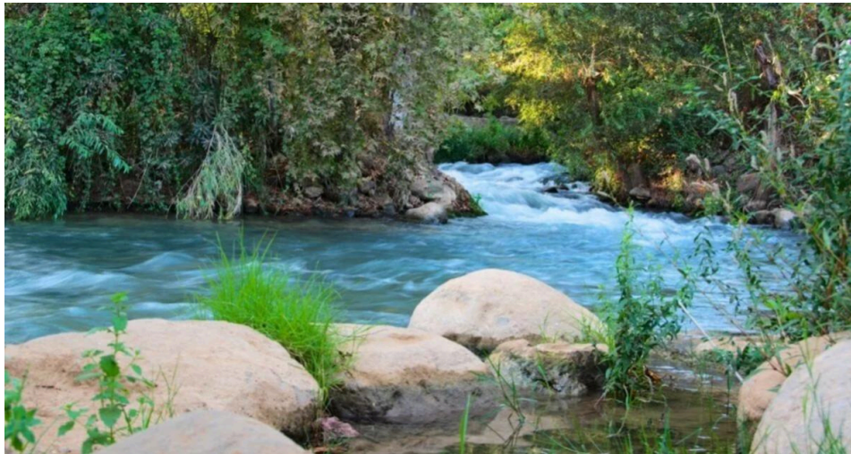
The River Jordan