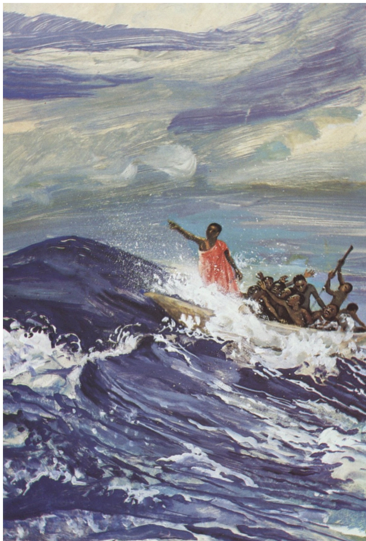
Christ Lulls the Storm by Jesus MAFA