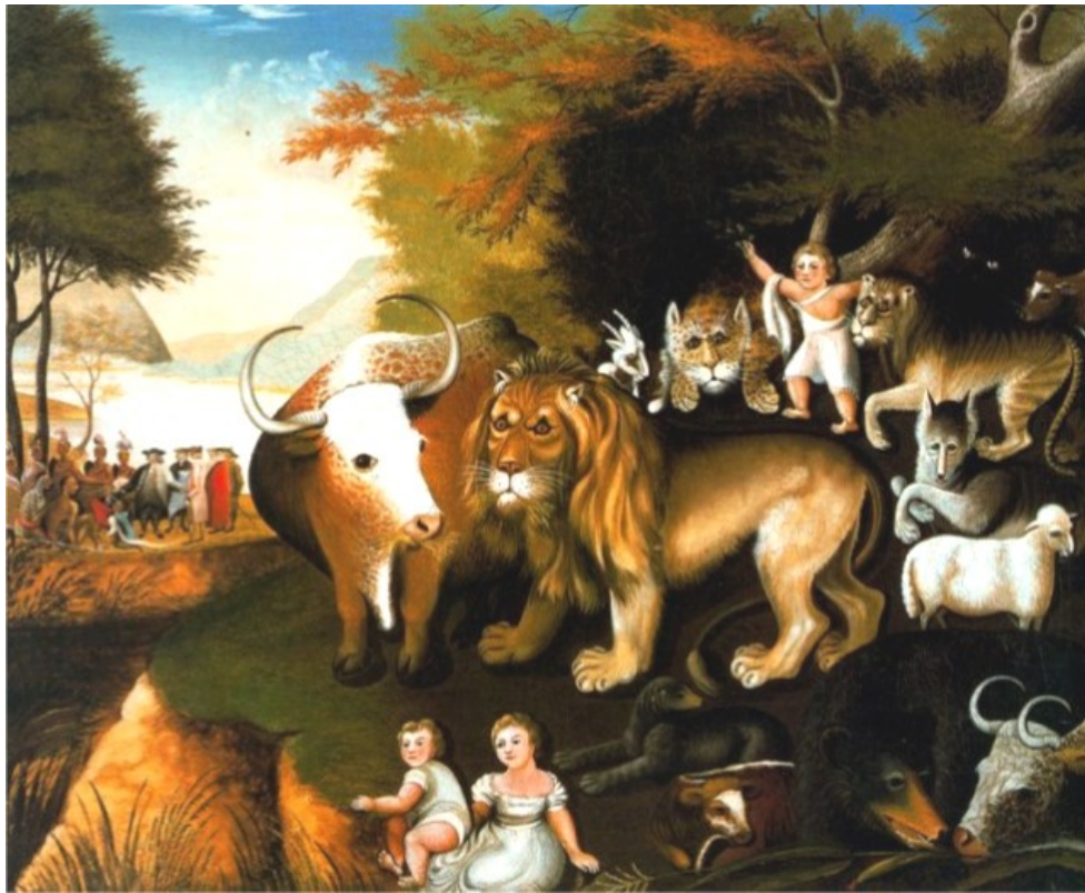
Peaceable Kingdom by Edward Hicks