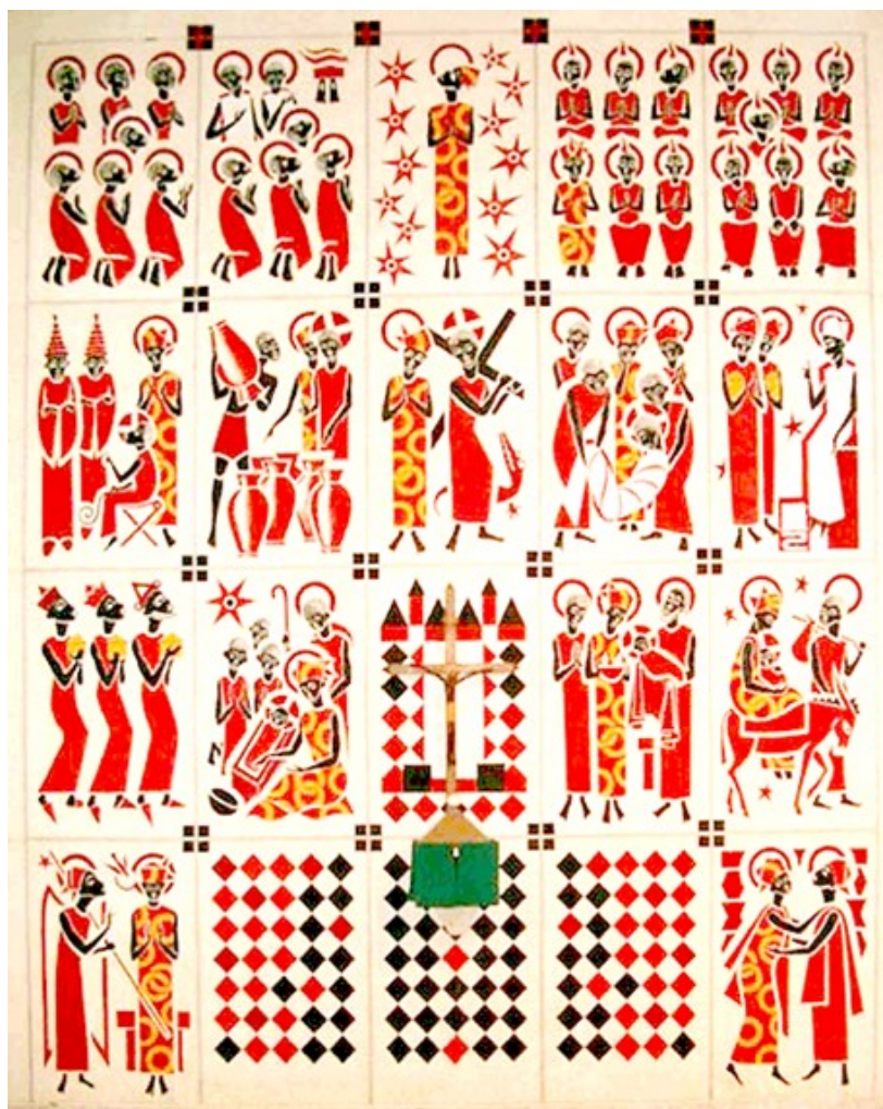
Mural from the Benedictine Abbey of the Immaculate Heart of Mary in Keur Moussa, Senegal