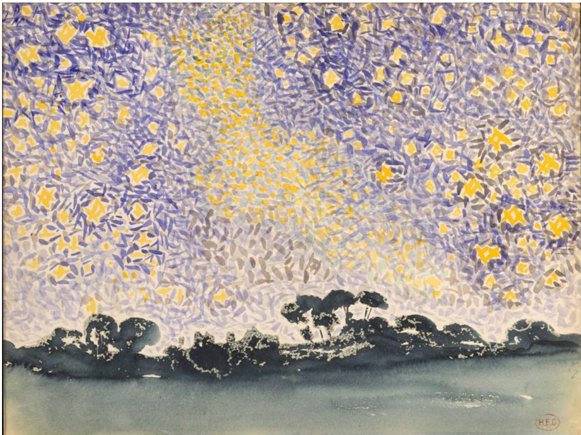
"Landscape With Stars" by Henri Edmond Cross