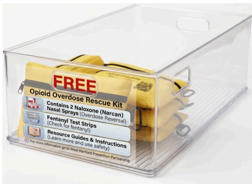
Lifesaving Opioid Overdose Rescue Kits