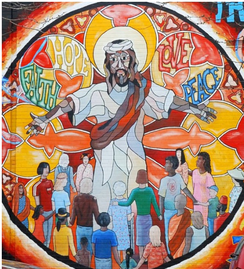
Jesus Mural of Faith, Hope, Love, and Peace, Chicago